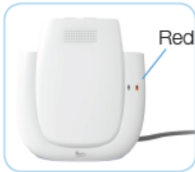
charge in progress