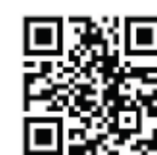
Welcome to MoMe